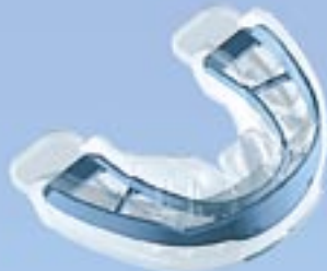
CUT-AWAY OF MYOBRACE® APPLIANCE