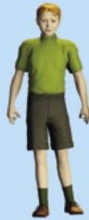
OPTIMUM AGE: 9 TO 11 YEARS

With daily use of 2 hours per day and overnight, the MYOBRACE® is a viable alternative to braces for most patients who are compliant. It can be combined with other appliances like the BENT WIRE SYSTEM and even fixed braces afterwards to obtain final tooth alignment in difficult cases if needed.