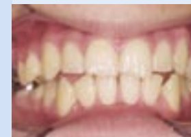
2 BENT WIRE SYSTEM TREATMENT COMPLETE