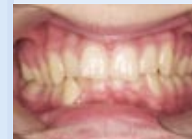
1 START OF TREATMENT