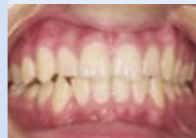
3 AFTER SIX WEEKS OF DAILY MYOBRACE® USE.