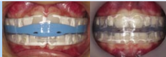
FAR LEFT: MYOBRACE® REGULAR